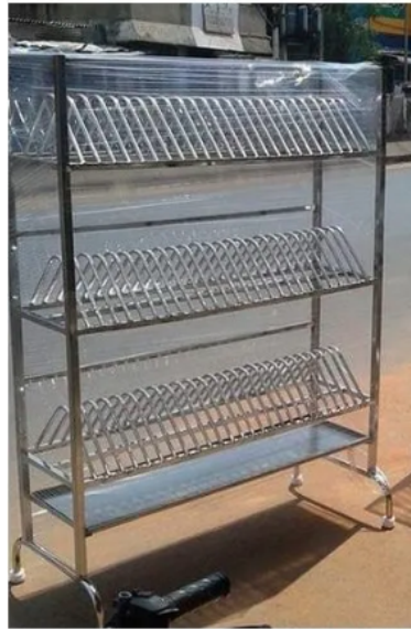
Item No: 204 SS POT RACK WITH 4 SHELVES (304) , SIZE (mm): 1070 x 585 x 1550 , Make: JANSHAKTI