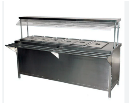
SS SERVICE TABLE WITH 3 SIDE COVERING & 2 U/S & FRONT SIDE SERVICE RAIL (304) SIZE (mm): 900 x 525 + 225 x 850 Make: JANSHAKTI