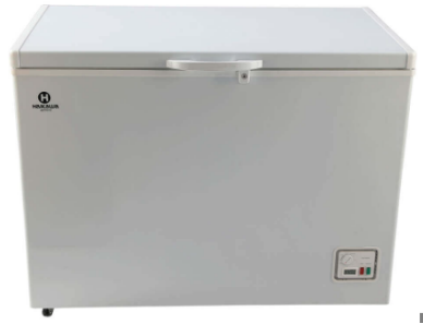
SINGLE DOOR VISI COOLER (4 SHELF) -300 LTR. SIZE (mm): 615 x 610 x 1790 Model - BLUESTAR - VC325D