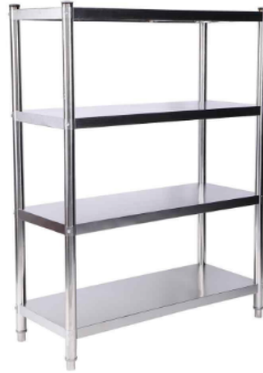
SS DUNNAGE RACK (304) , SIZE (mm): 1200 x 600 x 250 , Make: JANSHAKTI